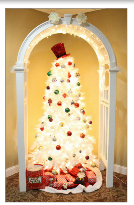
More photos on back cover